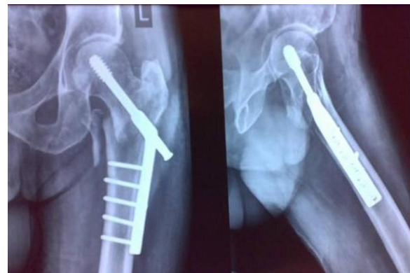
Fig. 3 Follow-up at 6 months

All the patients were operated using spinal anaesthesia. Fracture reduction and fixation was carried out on a fracture table using the standard reduction techniques. An image intensifier was used to visualize the reduction and also as a guide throughout the procedure for the Richards screw and plate placement. A lateral approach was utilized to expose the hip and a 125°, 130° or 135° angled DHS was used (Fig 2). Non-weight bearing or partial weight bearing walking was begun gradually depending on the fracture configuration and the stability of reduction & fixation. Regular follow-up was done at 3, 6 and 12 months respectively (Fig. 3).