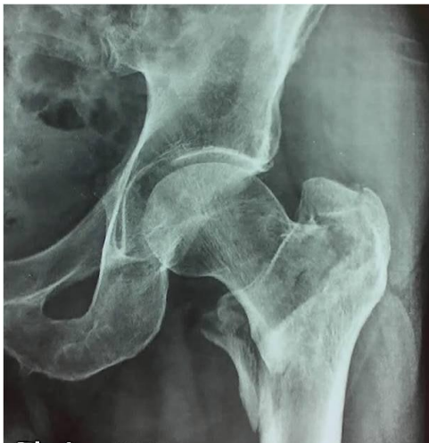
Fig. 1 Pre-operative x ray

at a tertiary care hospital. The inclusion criteria were skeletally matured patients with unstable intertrochanteric (Evan's type 3, 4 and 5) fractures. Patients with stable intertrochanteric fractures, medically unfit patients and old malunited fractures were excluded from the study. All the fractures were classified using Evans classification system. Well written informed consent was obtained from all the patients. All the necessary haematological and radiological work-up (Fig. 1) was done for all the patients. Prior ethical committee approval was obtained before the commencement of the study.