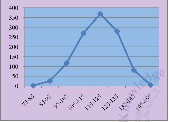
Figure 1: Line Graph Showing Attitude of Students towards Violence at all Levels of Education

Table 1 indicates that, for all the levels of education i.e., for Std. IX, F.Y.J.C. and F.Y. Degree College, the mean, median and mode scores of attitude towards violence are coinciding other and therefore the distribution for all the levels of education is nearly normal. Fig. 1 shows the line graph of attitude of students towards violence at all levels of education and Fig. 2 bar graph showing attitude of students towards violence on the basis of gender at all levels of education.