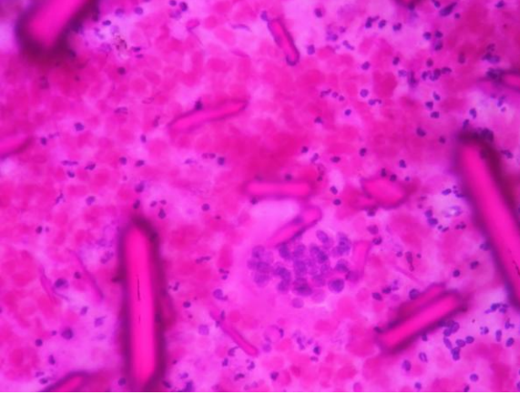
Figure 3: Smears showing crystalloids and a multinucleated foreign body giant cells (H&E,X400)