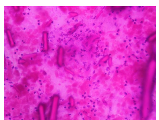
Figure 2: Smears showing crystalloids with adjacent epithelioid cell cluster (H &E, X400)

Foamy macrophages were noted in some foci. Background showed eosinophilic necrotic debris. No acinar or ductal elements were seen. Cytological diagnosis of benign cystic lesion with the possibility of retention cyst of parotid was made.