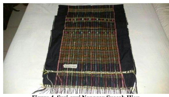
Figure 4. Suri-suri Nanggar Suasah Hiou

As the name indicates, this hiou has suasah and nanggar motives; the nanggar is a place to order what is wanted. The dark blue colored weaving and long black tassels are accompanied with the tips. This fabric has a line lengthwise and line the dots. Its width is given the ornament and the most detailed is on the lid. This weaving is placed on the shoulder as cloth coverage.