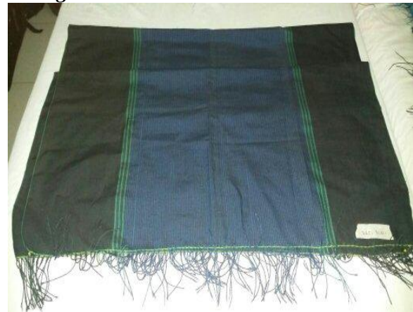
Figure 8. Ragi Panei Hiou

This middle section of the piece is colored almost exactly like the suburbs but has a lot of light blue lengthwise stripes. On either side of the central part, there is a dividing line in white gray or light blue. The simple fabrics are worn by old men and women, but they are not forbidden for young people. The hiou is woven from cotton yarn base with black colour, and the middle section of the fabric is combined with lungsi blue and an extra feed at both ends of the red, white, yellow, green colours.