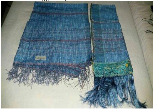
Figure 7. Hati Rongga Tapak Catur Hiou

Hati Rongga Tapak Catur Hiou is made of cotton yarn with a blue base color and the middle section of the fabric is combined with black lines forming a small path and ornate belt lungsi tapak satur motive. The decoration of the hiou is only the line motive that is in the middle and the two ends of hiou use white, yellow, green and