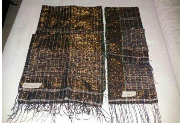
Figure 6. Hati Rongga Hiou for male