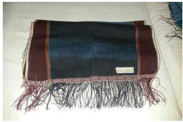
Figure 2. Bintang Maratur Hiou

Bintang Maratur described the regular line of stars.