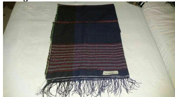
Figure 3. Ragi santik hiou

The outer end or the edges of ragi santik hiou are fitted with tassels.