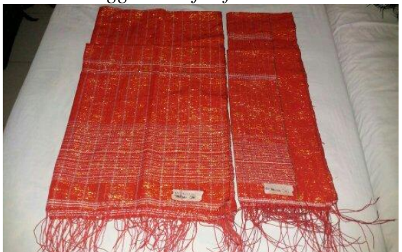
Figure 5. Hati Rongga Hiou for female