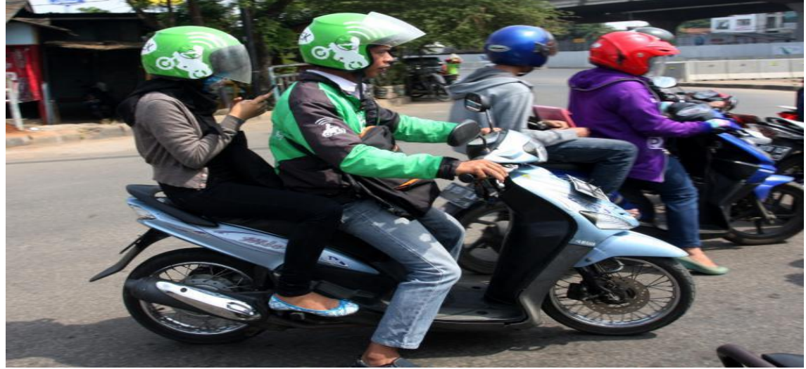
Figure 3. Go-Jek rider and his passanger