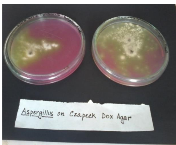
Fig – 1, Aspergillus niger on czapeck Dox agar medium

and observed under microscope revealed that the conidial heads are black and radiated, clearly differentiated thick mycelium with black speherical spores. The isolated fungal strain upon sub culturing with modified Czapeck dox agar media supplemented with tributurate and phenol red indicator shown the disappearance of pink colour indicating the growth of Aspergillus niger which was further confirmed with microscopic examination (Fig - 1 and 2).