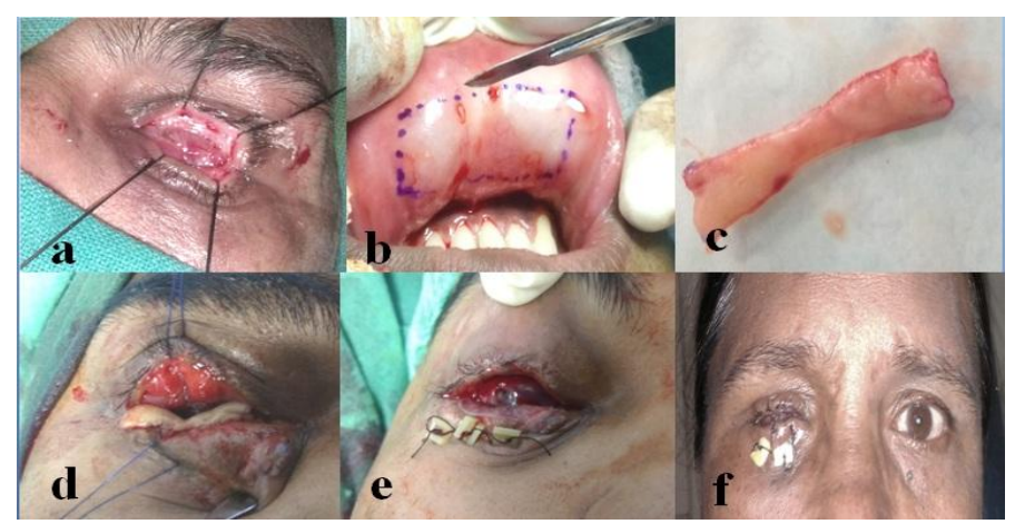
Fig 3: a) Lid traction suture, b) Harvesting of oral mucous membrane graft, c) Harvested MMG, d) MMG over recipient site, e) Fornix formation suture with retained conformer, f) Fornix formation suture with lid closing suture