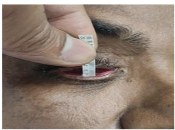
Fig 2: Measurement of fornix depth using a Schirmer's strip