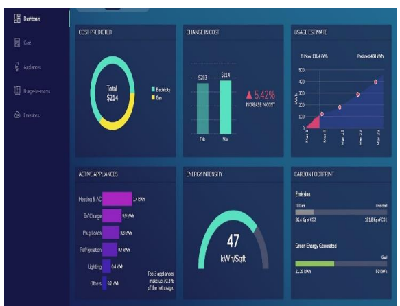
Figure 3: Admin Interface

in real time. With a user-friendly dashboard, residents can easily submit complaints regarding infrastructure problems, water shortages, power outages, and other concerns. Each issue is categorized based on urgency, ensuring that critical problems receive immediate attention.